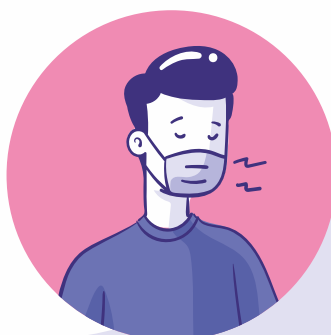
Wear a facemask if you are sick