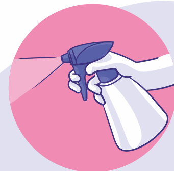
Clean and disinfect