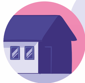
Stay at home