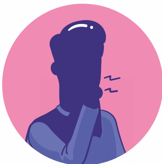
Cover coughs and sneezes