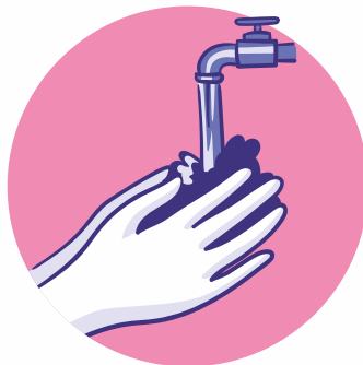
Clean your hands often